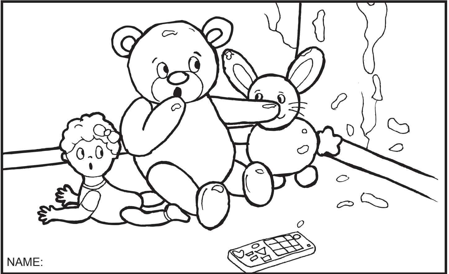
Lead can land on toys, remote controls and other objects children often touch and put in their mouths.