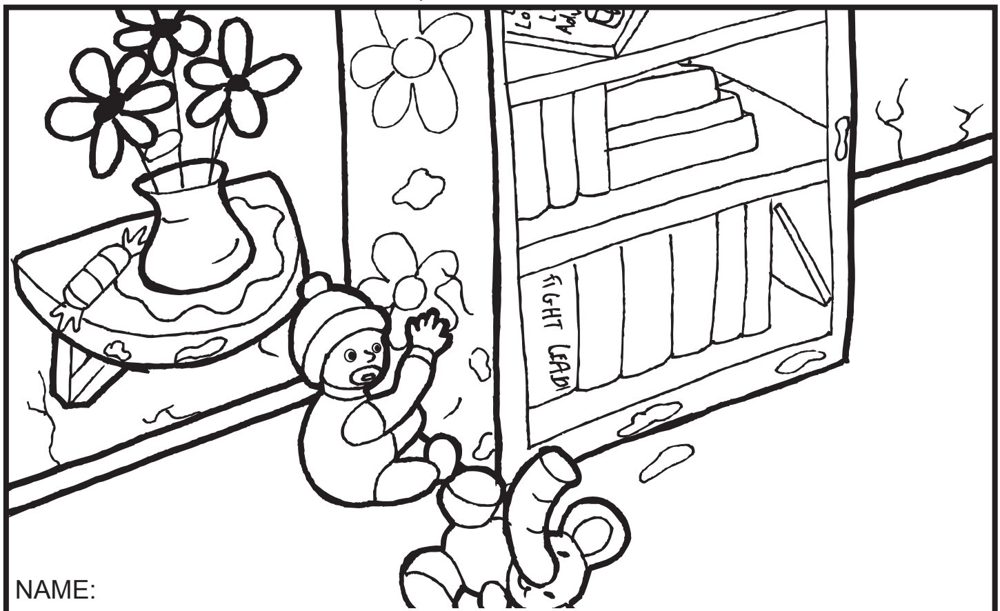
Lead can peel off older furniture where children can easily pick it off and ingest it.

For more information, please contact Grondin Construction, Inc. at (858) 549-1682.